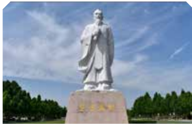
Hometown of Bian Que