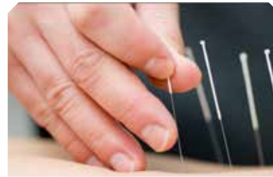
Birthplace of Acupuncture and Moxibustion