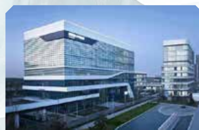
International Medical Center Campus